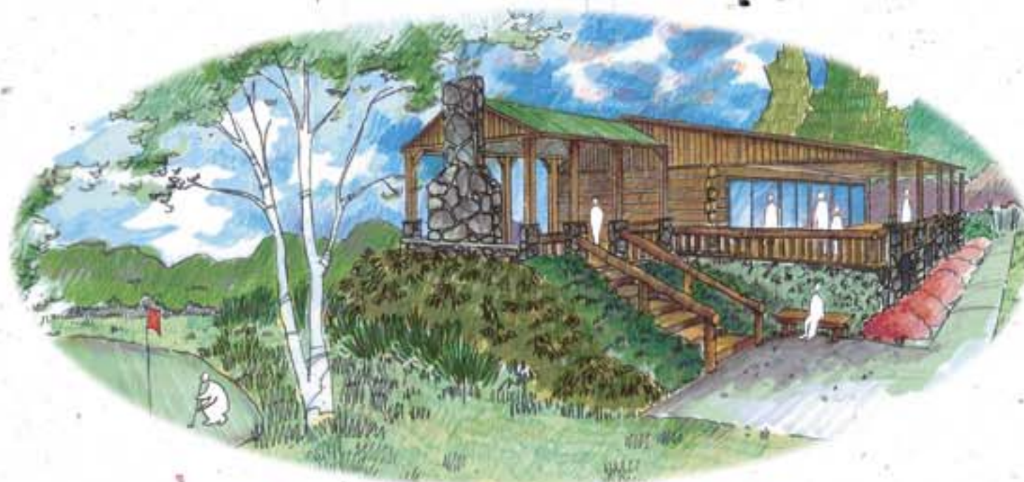
Club House by the golf course