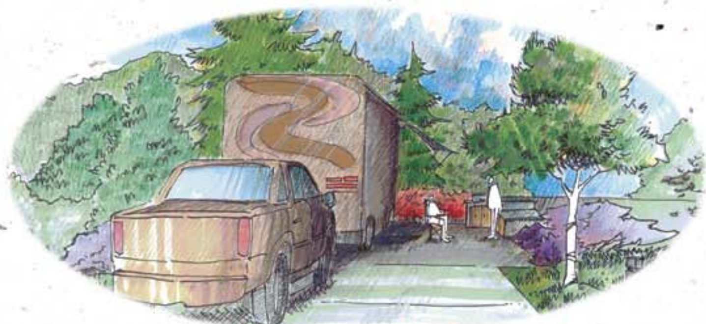
Large fairway & lakeview lots